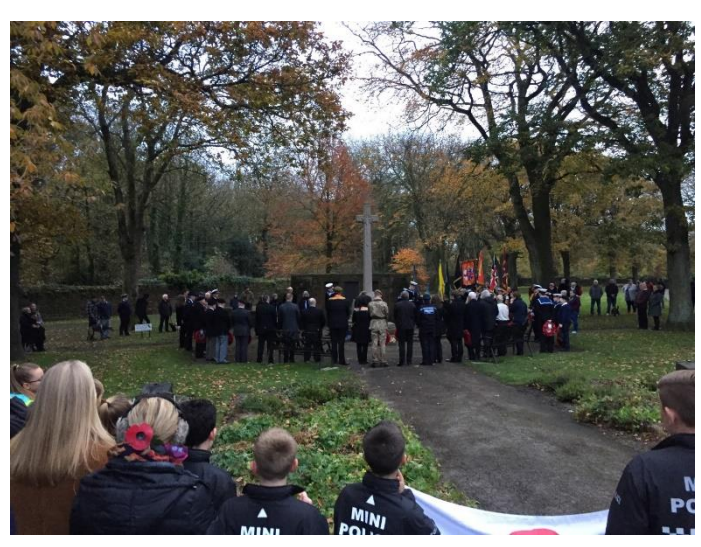
Wreath laying ceremony at the Cenotaph on Remembrance Sunday.